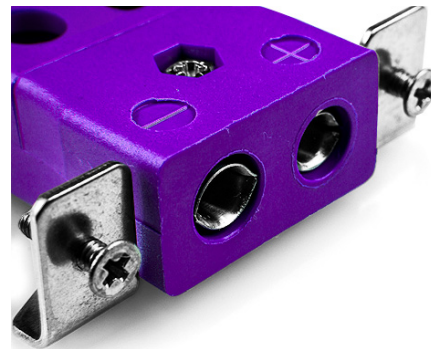
Standard Socket - Quick Wire with stainless steel mounting bracket (dimensions in mm)

Labfacility are the UK's leading manufacturer of Temperature Sensors, Thermocouple Connectors and associated Temperature Instrumentation and stockings of Thermocouple Cables. The Company has been trading since 1971 and is ISO9001 accredited.