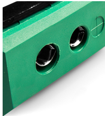
Standard Fascia Socket (with nylon mounting clip) (dimensions in mm)

Labfacility are the UK's leading manufacturer of Temperature Sensors, Thermocouple Connectors and associated Temperature Instrumentation and stockings of Thermocouple Cables. The Company has been trading since 1971 and is ISO9001 accredited.