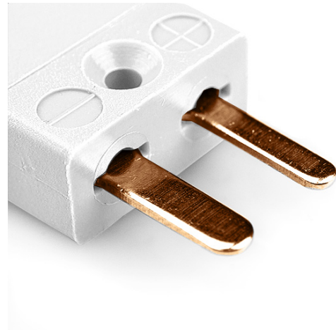
Miniature in-line Plug (dimensions in mm)

Labfacility are the UK's leading manufacturer of Temperature Sensors, Thermocouple Connectors and associated Temperature Instrumentation and stockings of Thermocouple Cables. The Company has been trading since 1971 and is ISO9001 accredited.